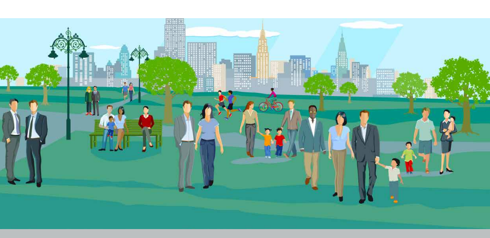
The foundation of your financial planning